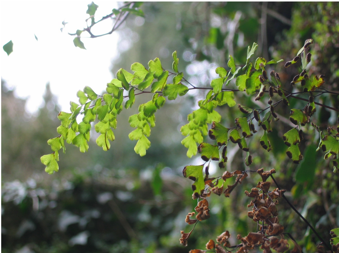
Adiantum capillus-veneris at Batheaston (2008).