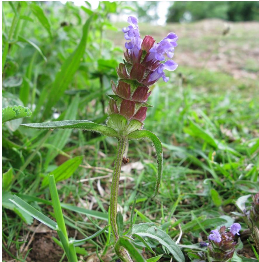
Prunella x intermedia at Cheddar (2009).