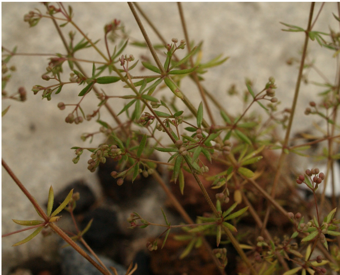
Galium parisiense in Taunton (2012).