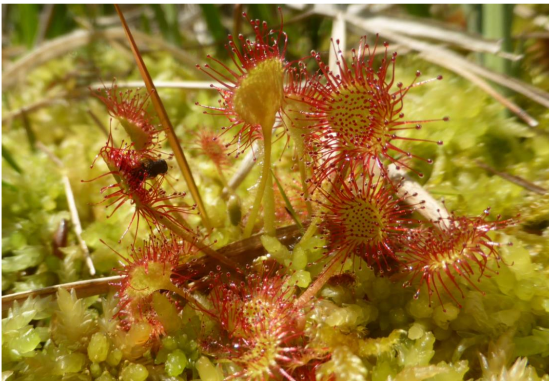
Drosera rotundifolia at Widcombe Moor (2015).