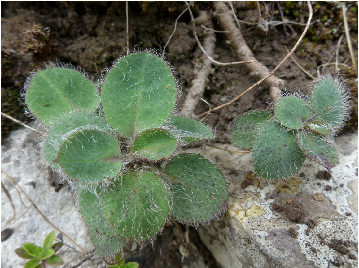
Hieracium schmidtii on S-facing side of Cheddar Gorge (2016).

It is still to be found in Cheddar Gorge, although certainly not “in fair abundance”: only 12 plants were found during the Cheddar Rare Plant Survey in 2016, with usually only a single tiny rosette at each location (Crouch, 2016). The species has clearly declined in Somerset and indeed does not occur anywhere in quantity (McCosh & Rich, 2011). It has a very scattered distribution and since 2000 has only been recorded in Somerset and the Outer Hebrides. Records at Cheddar Gorge are the only records for England since before 1960.