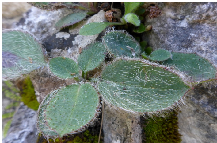
Hieracium schmidtii on S-facing side of Cheddar Gorge (2016).