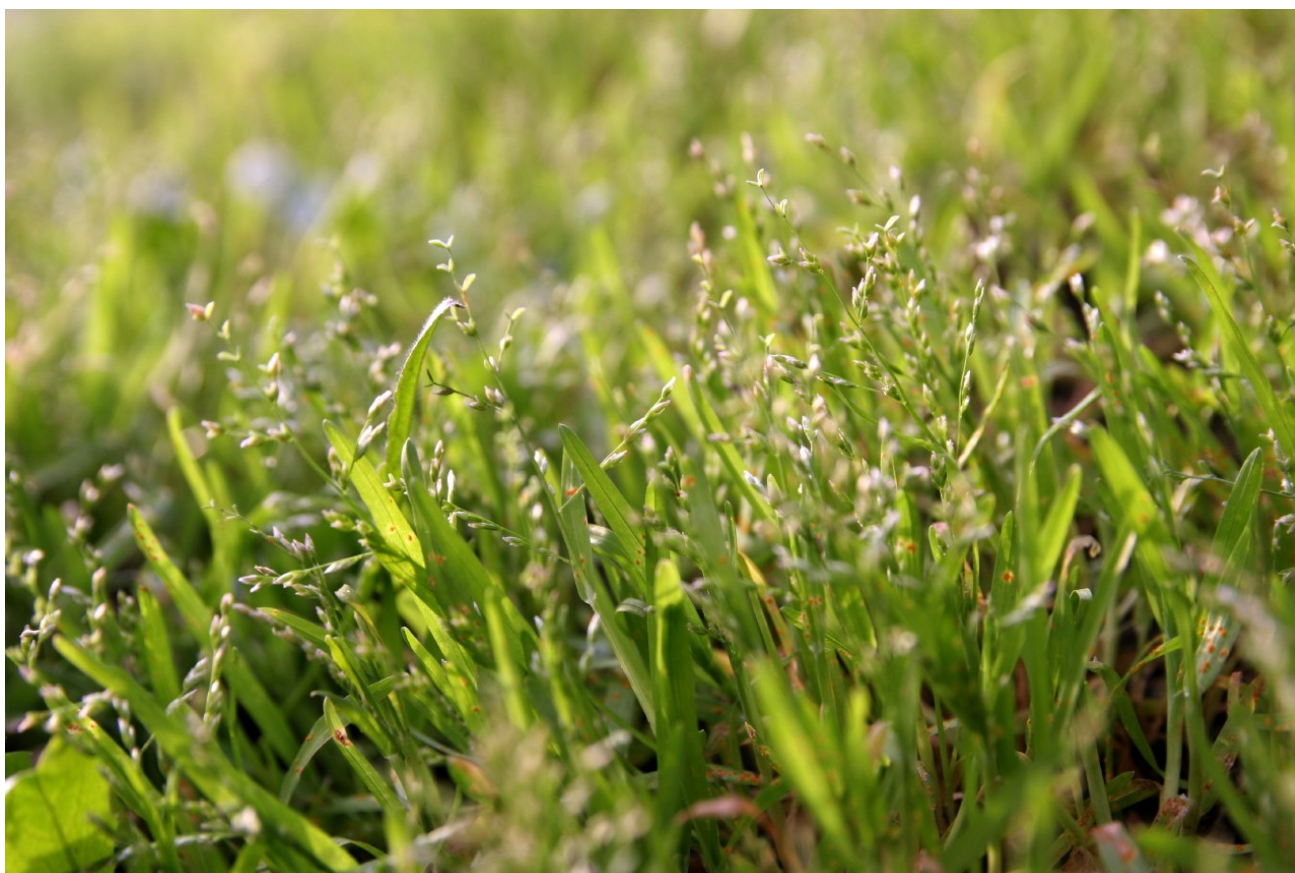
Poa infirma at Wells (2008).