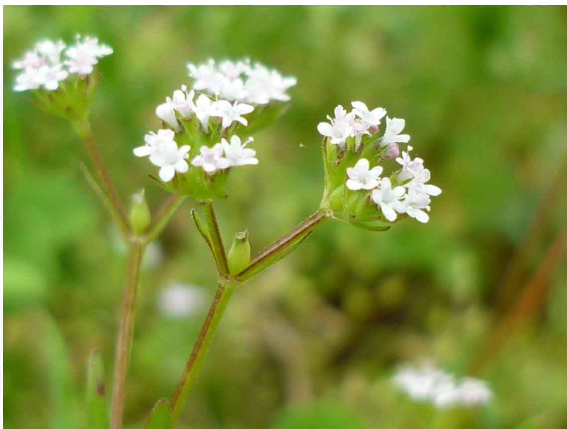
Valerianella dentata at Laverstoke Park, Hampshire (2013). [awaiting Somerset photo]