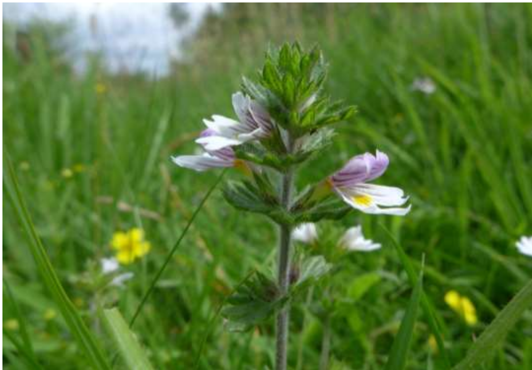
Euphrasia anglica near Totty Pot, Cheddar Gorge (2016).