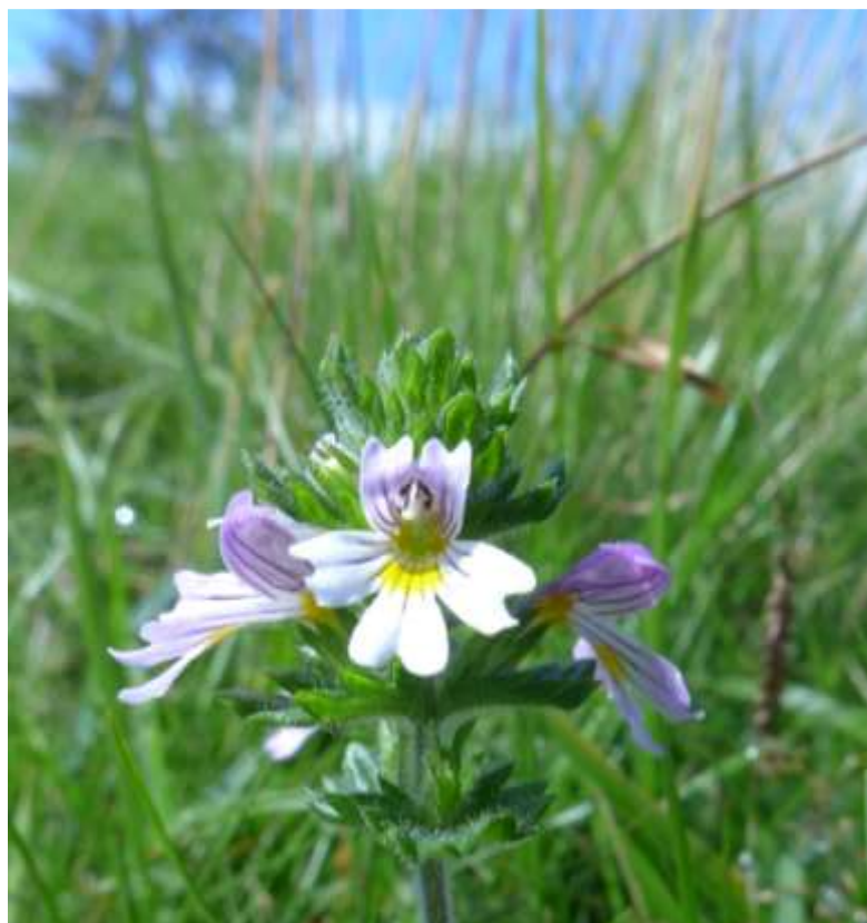
Euphrasia anglica at Cheddar Gorge (2017).