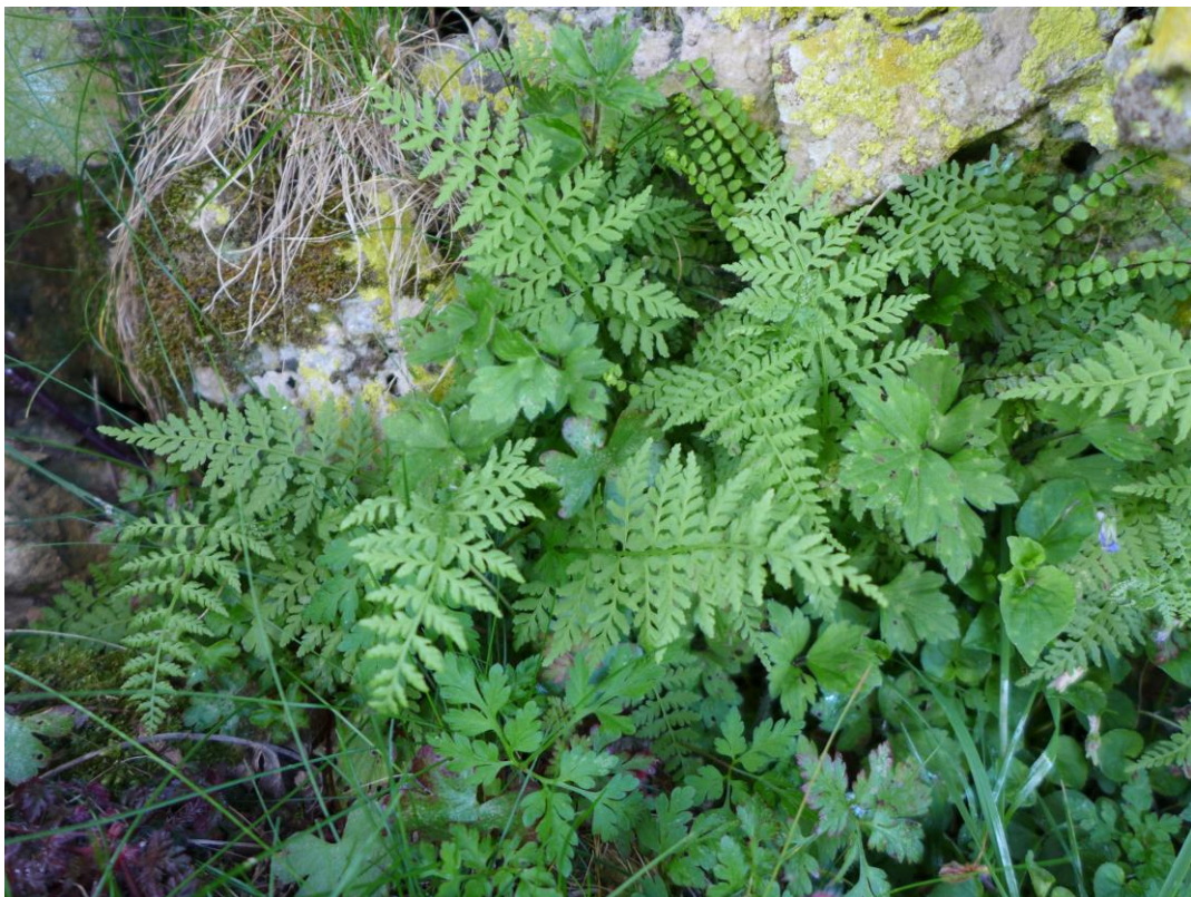
Cystopteris fragilis at Upper Lansdown (2017).