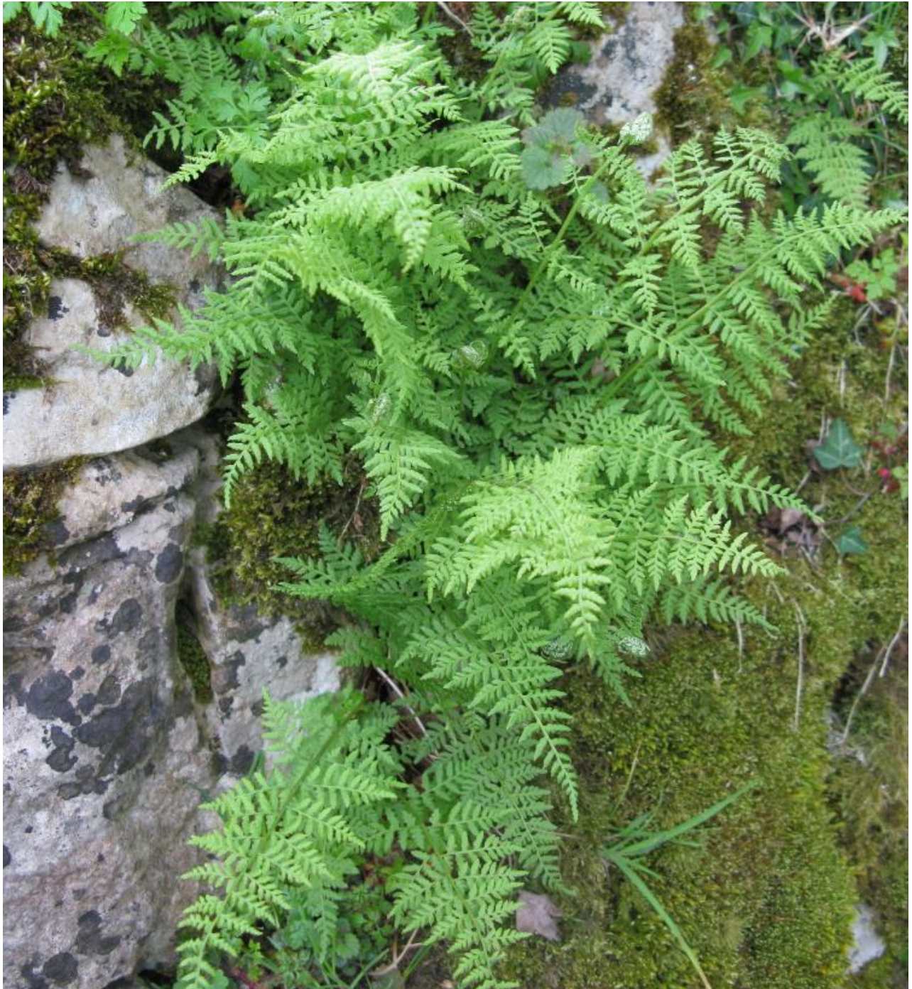
Cystopteris fragilis at Black Rock, Cheddar (2009).