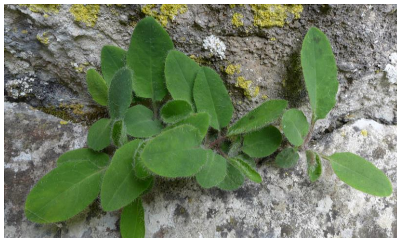
Hieracium cyathis at Cheddar Gorge (2016).