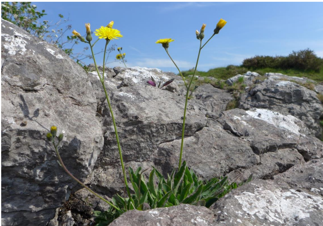
Hieracium cyathis at Ubley Warren (2018).