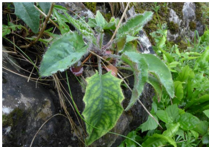
Hieracium stenolepiforme east of Pig's Hole, Cheddar Gorge (2016).