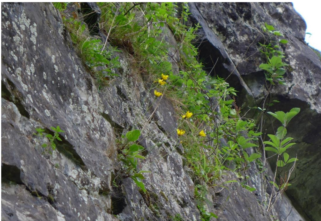
Hieracium stenolepiforme east of Pig’s Hole, Cheddar Gorge (2016).