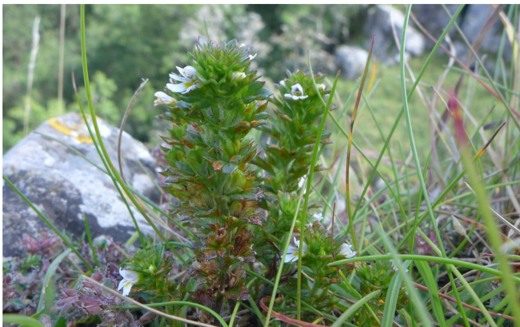
Euphrasia tetraquetra at Cheddar Gorge (2017).