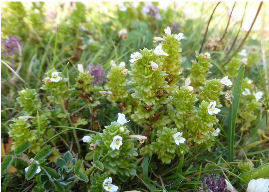
Euphrasia tetraquetra on Brean Down (2014).